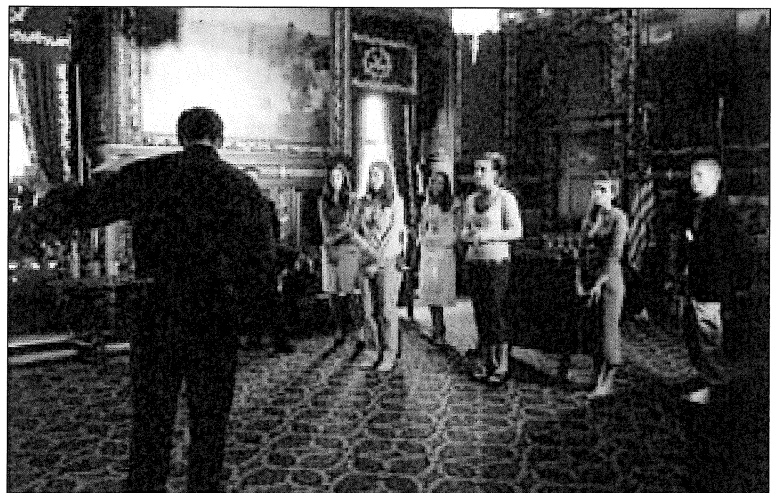
A member of the Minnesota Historical Society meets the pages in the governor's office.